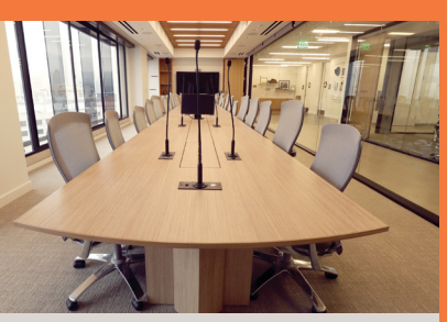
16 Person Conference Room – 324 sq. ft.