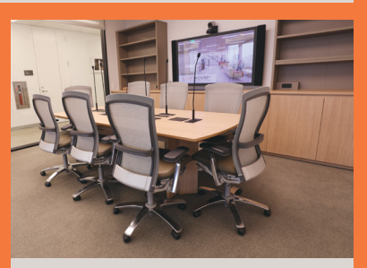
8 Person Meeting Room - 180 sq. ft.