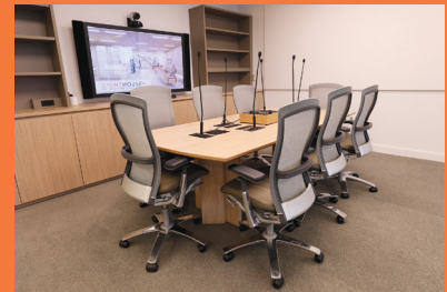
8 Person Meeting Room – 213 sq. ft.